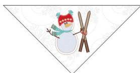
Up to Snow Good

Look at your Cutie's monthly summary. It will tell you what triangle block you need to make and what page it is on. Make 4 identical triangle blocks.