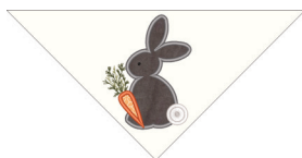
Some-bunny Carrots About You