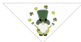
Lucky and I Gnome It