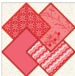
Deck of Cards