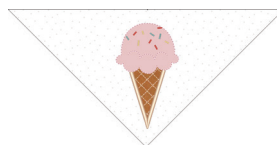
With a Cherry On Top!